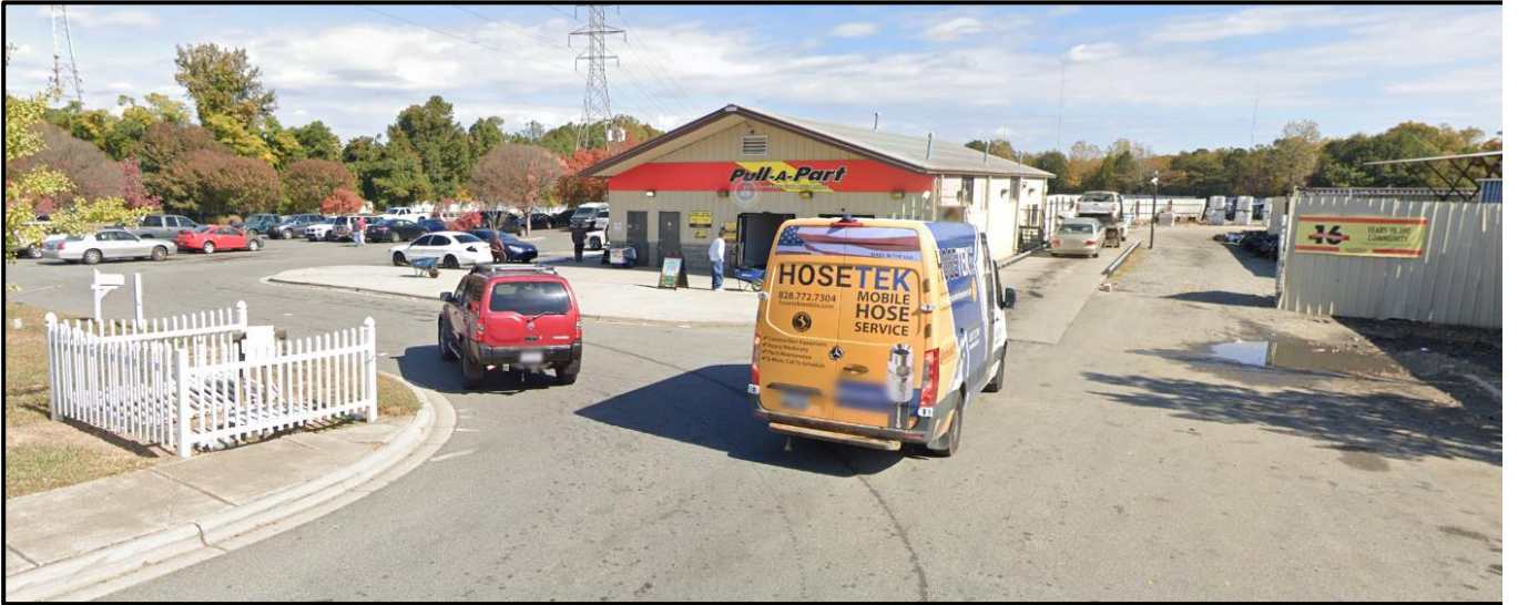
The property to the south along North Tryon Street is the Pull-A-Part auto sales facility.