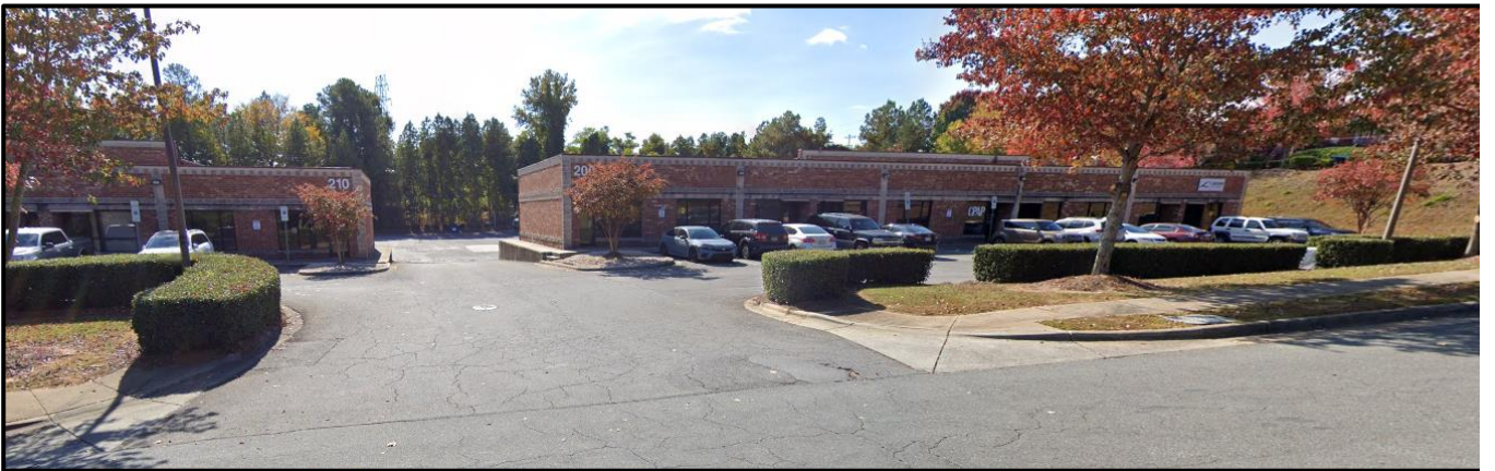
The property to the east along East Arrowhead Road is developed with an office/warehousing use.