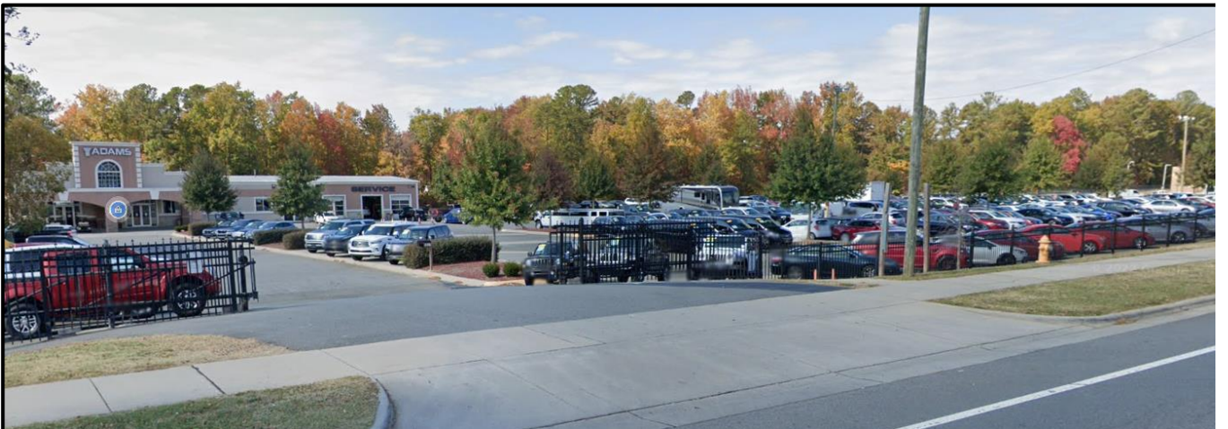
The property to the west across North Tryon Street is developed with a car sales/repair use.