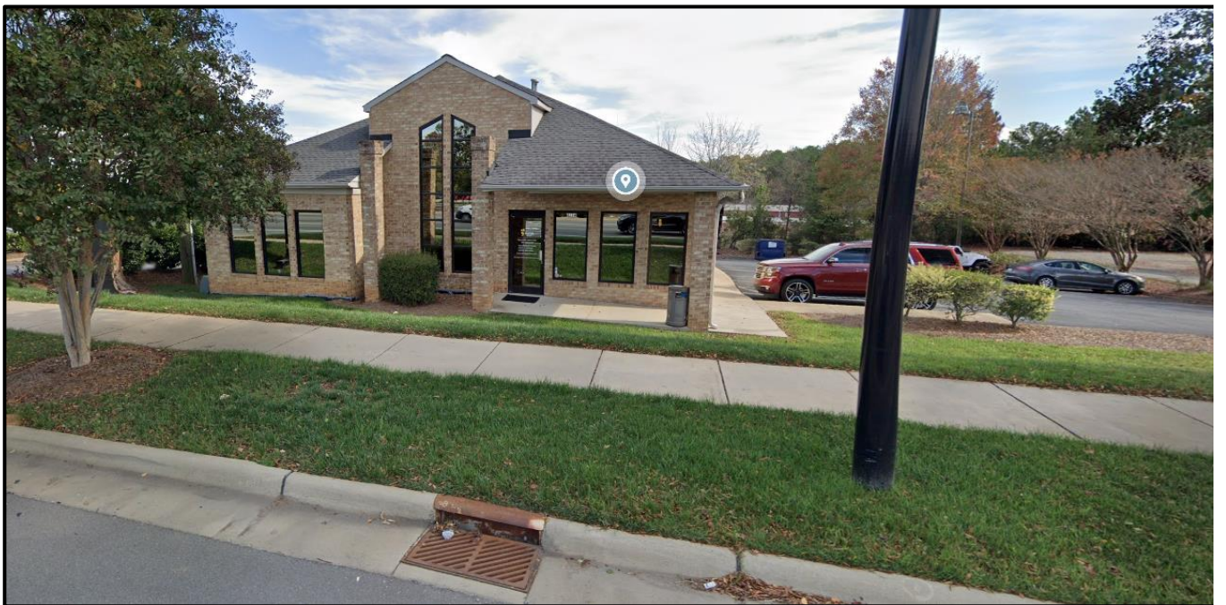
The property to the north along North Tryon Street is developed with an office building.