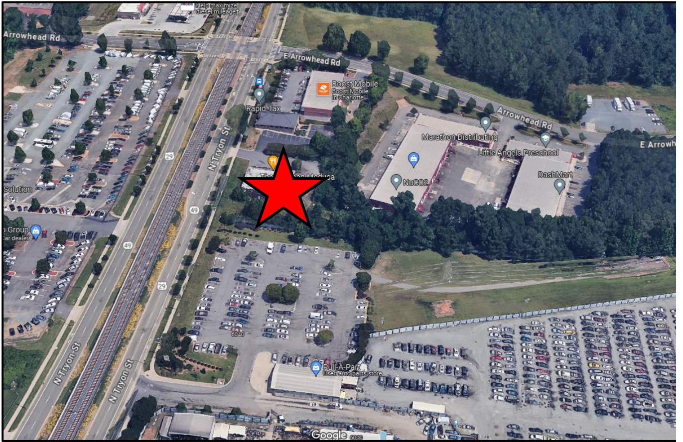
The subject property is denoted with a red star.