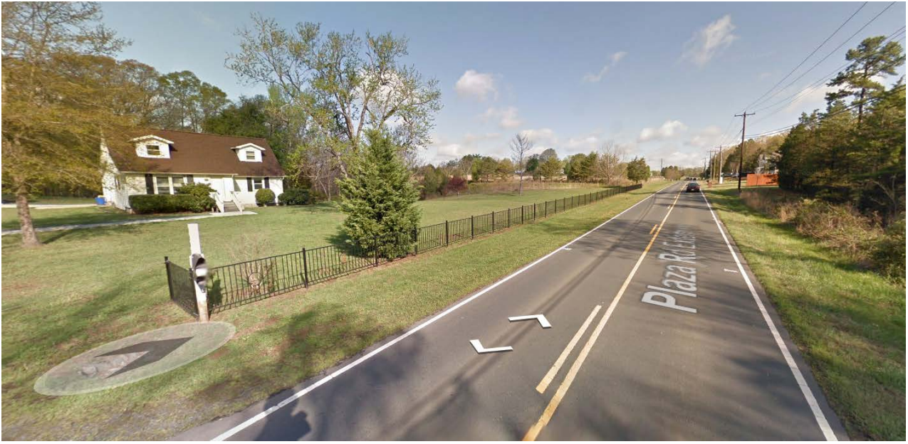
North of the site are single family homes.