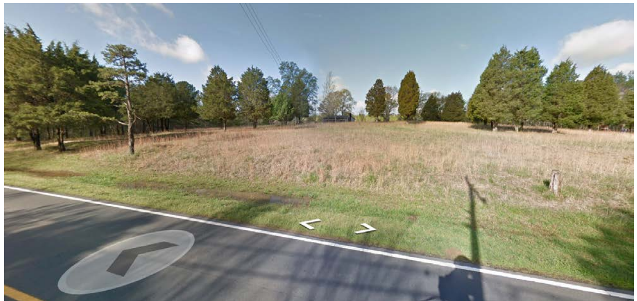
The subject site is developed with one single family home.