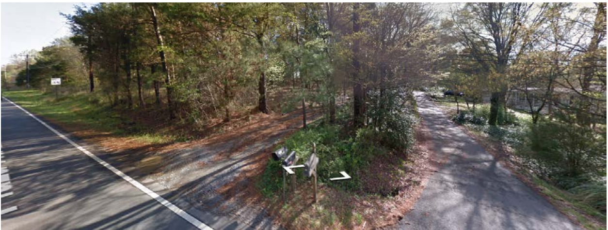
East of the site, across Plaza Road Extension in Cabarrus County, are single family homes on wooded lots.