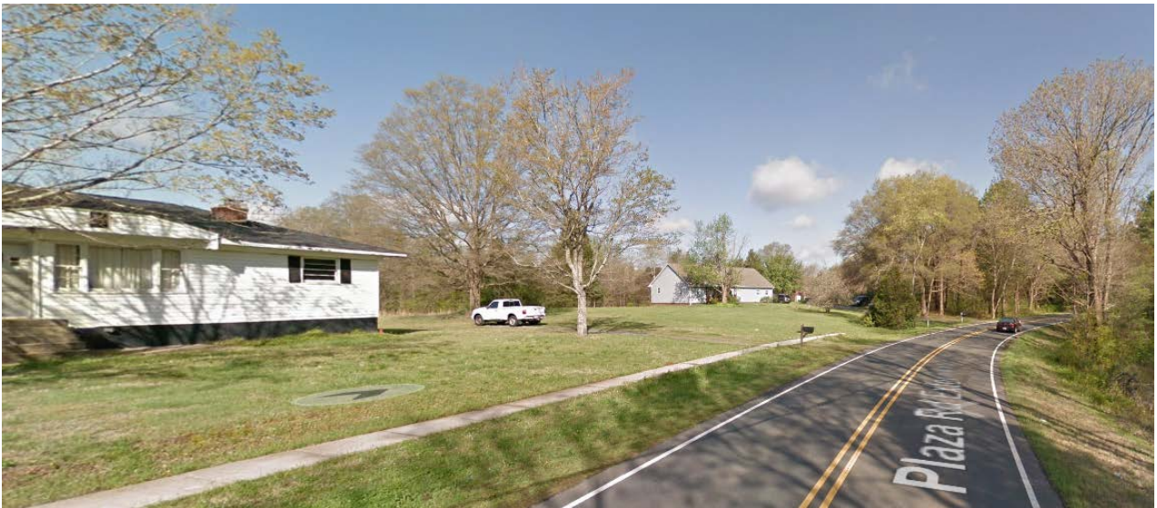
South of the site are single family homes.