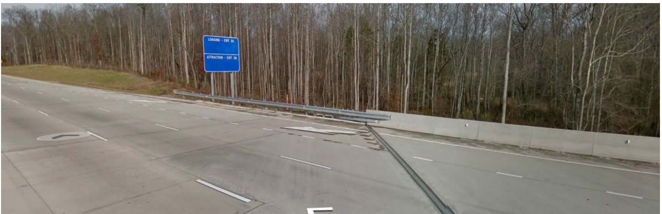
To the south it is bordered by Interstate 485 and vacant land.