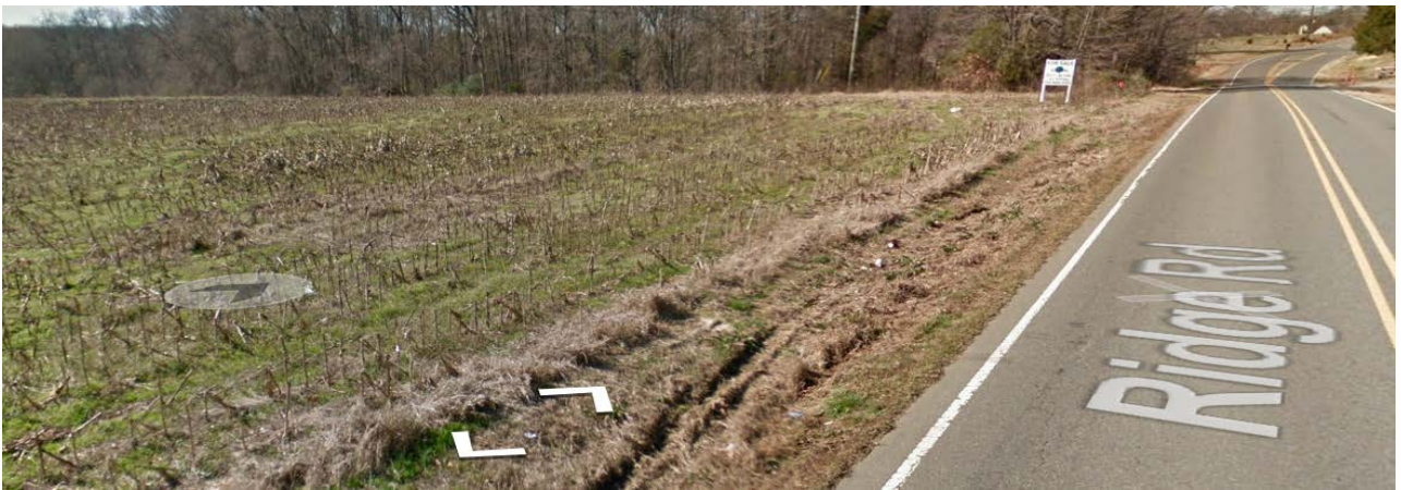
The subject property is vacant.