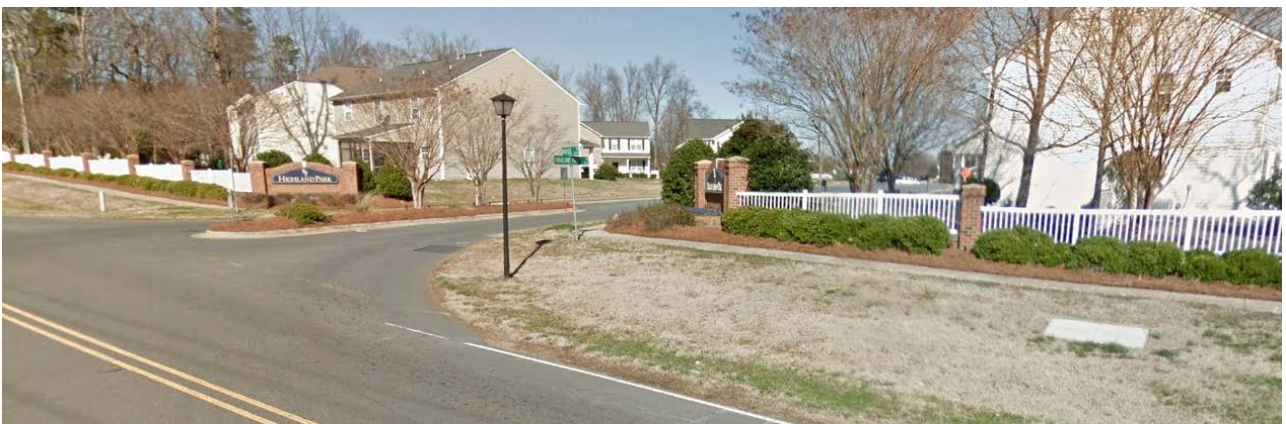
To the north across Ridge Road is a single family subdivision.