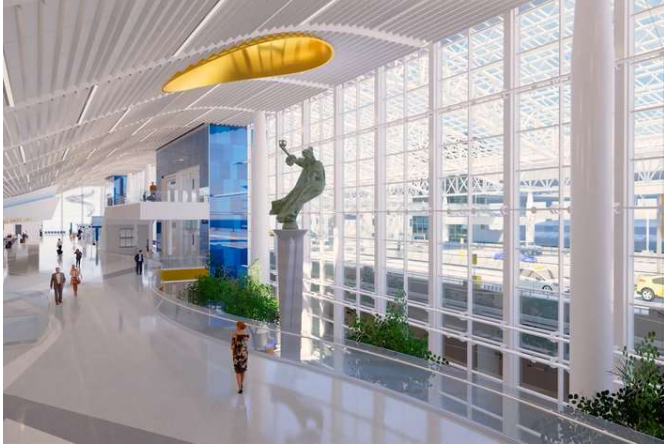
Terminal Lobby Expansion