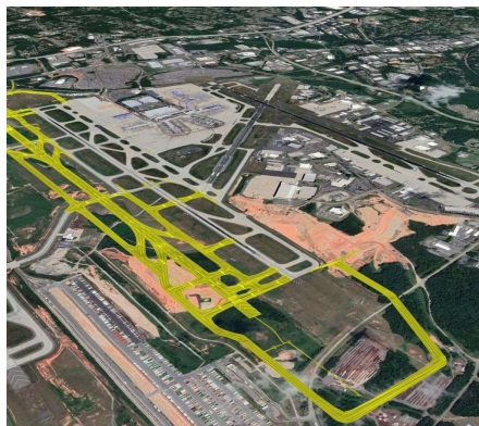
North End Around Taxiway