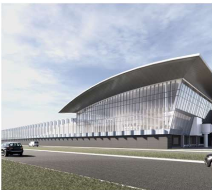
Concourse A Expansion Phase II