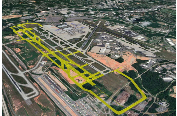
Fourth Parallel Runway