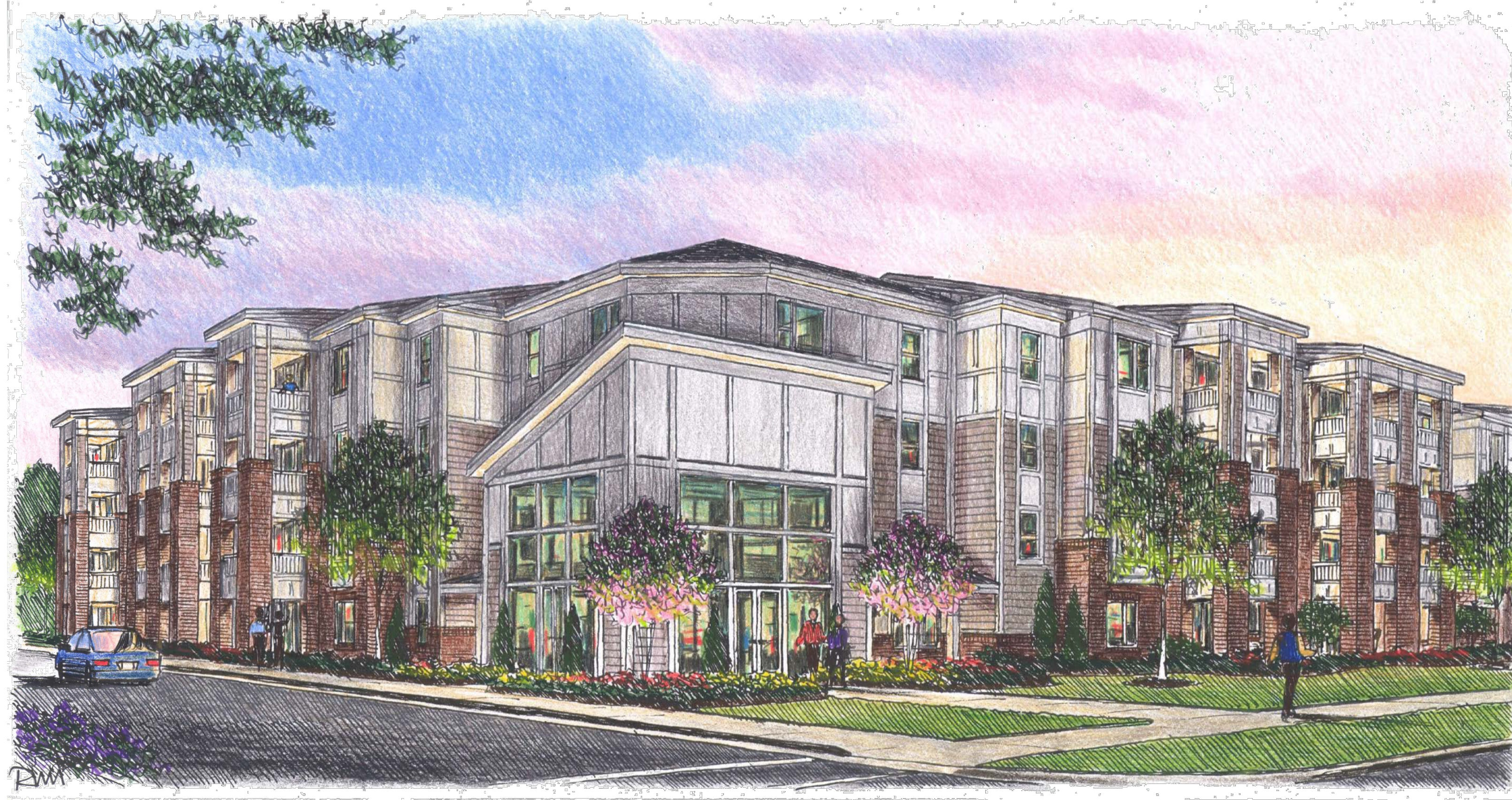
ILLUSTRATIVE EXAMPLES These renderings are provided to reflect the architectural style and quality of the buildings to be constructed on the Site.