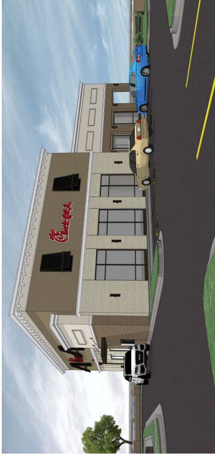
Perspective View - Drive-Thru

These perspectives are provided to reflect the architectural style and quality of the building to be constructed on the Site. The actual building constructed on the Site may only have minor variation from this illustration that adhere to the general architectural concepts and intent illustrated is maintained.