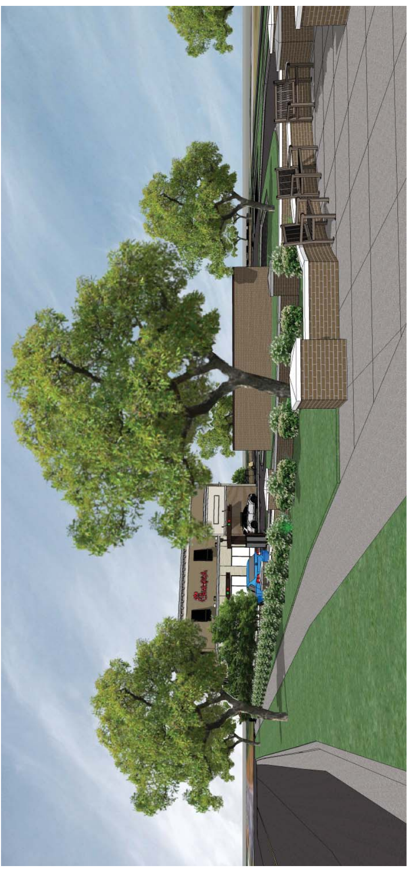
Perspective View - Street Level View