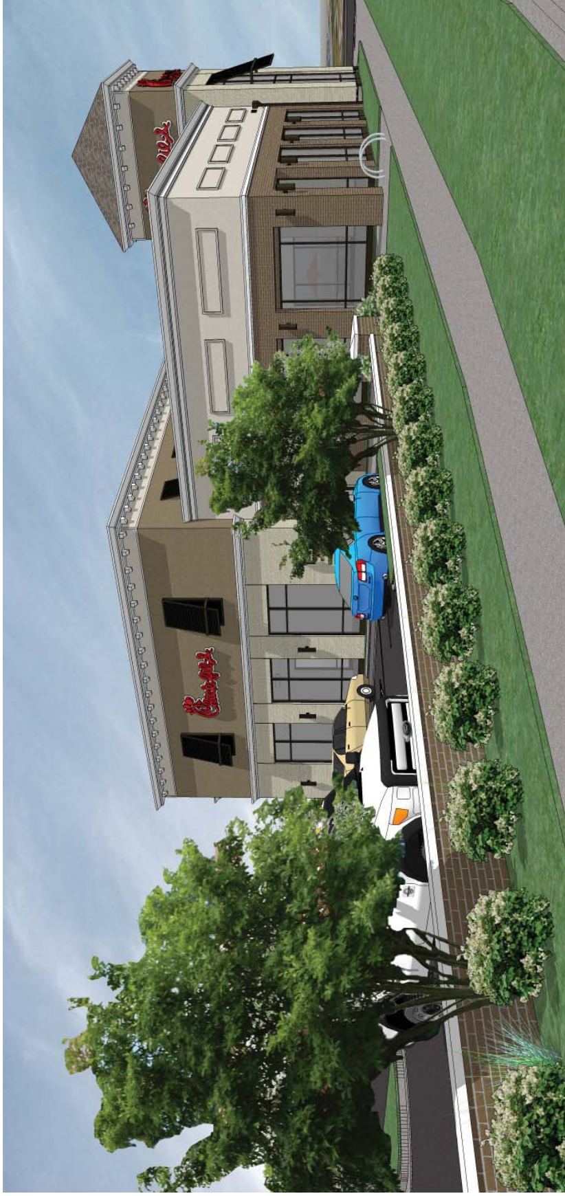
Perspective View - Street Level View