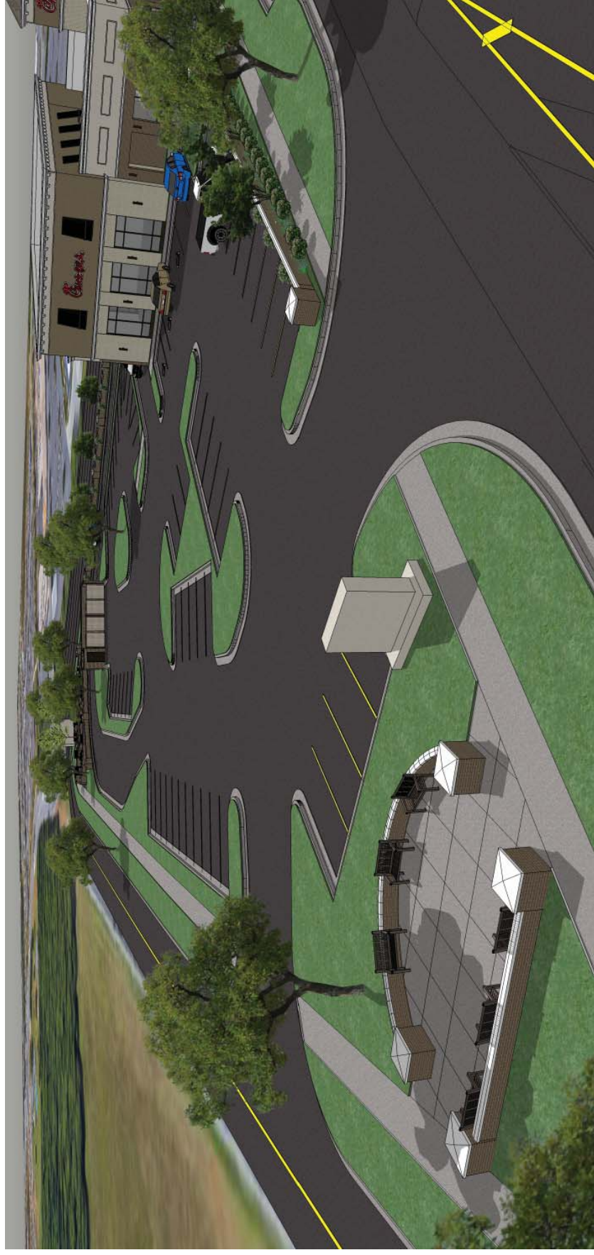
Perspective Views - North Plaza