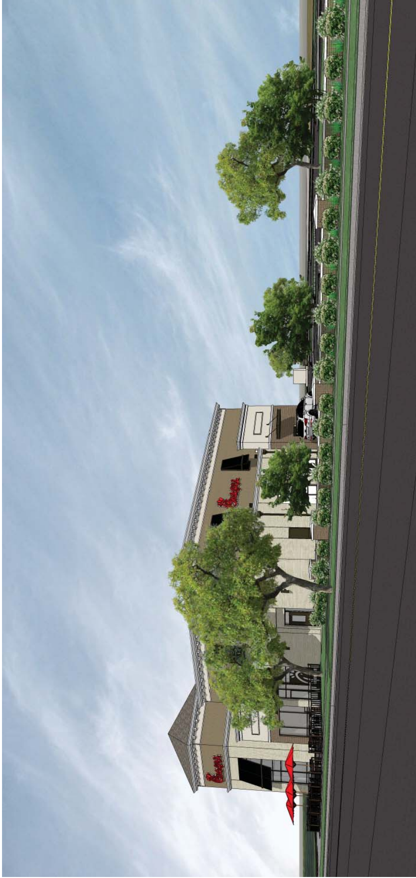
Perspective View - Street Level View