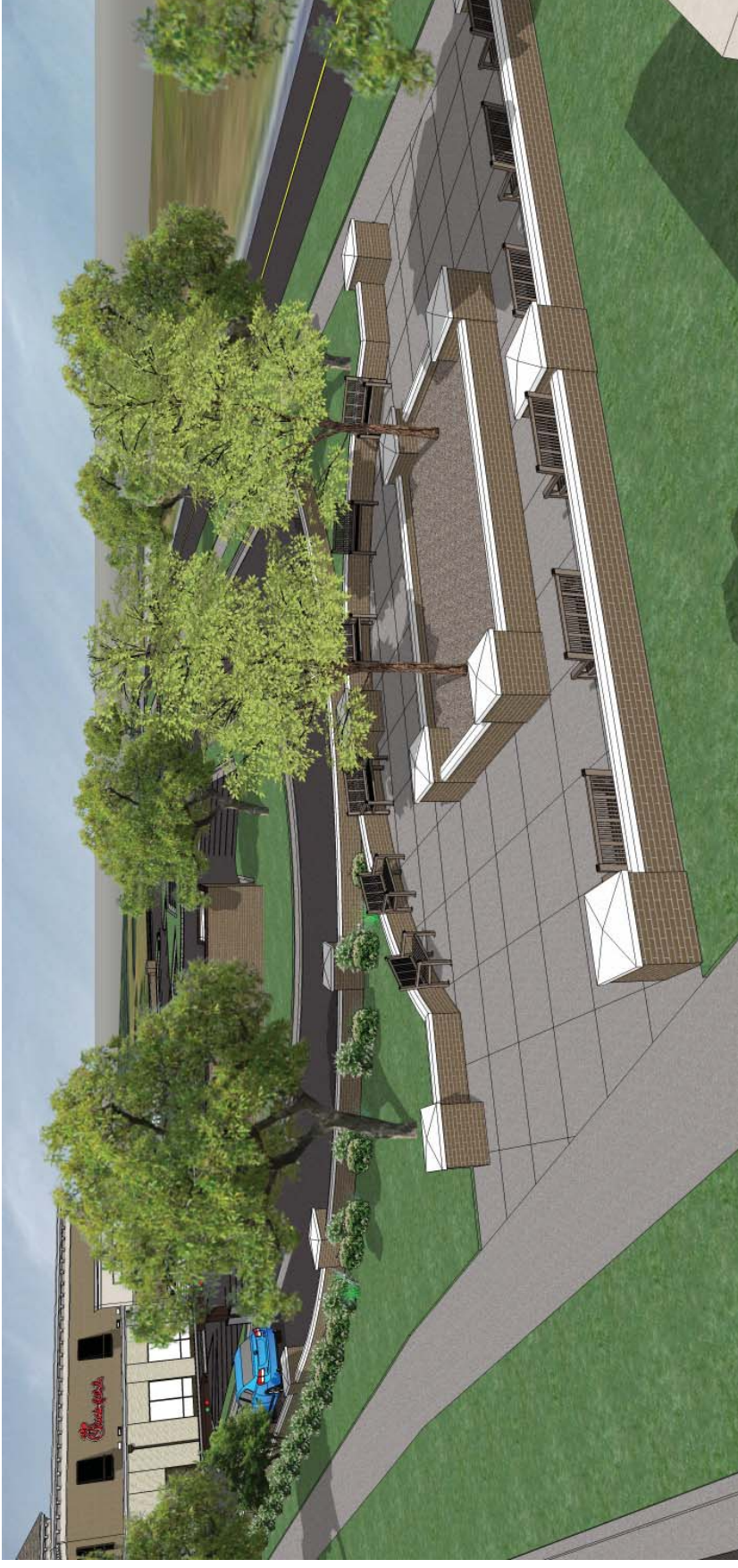
Perspective View - East Plaza