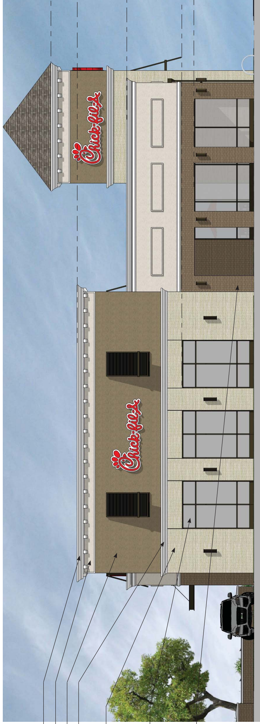
Elevation - Entry & Service Yard

T/ROOF CAP 33'-9" T/PARAPET 29'-5 1/2" T/PARAPET 21'-3" T/BAND 15'-6" T/WINDOW 10'-0" FINISH SLAB 0'-0"