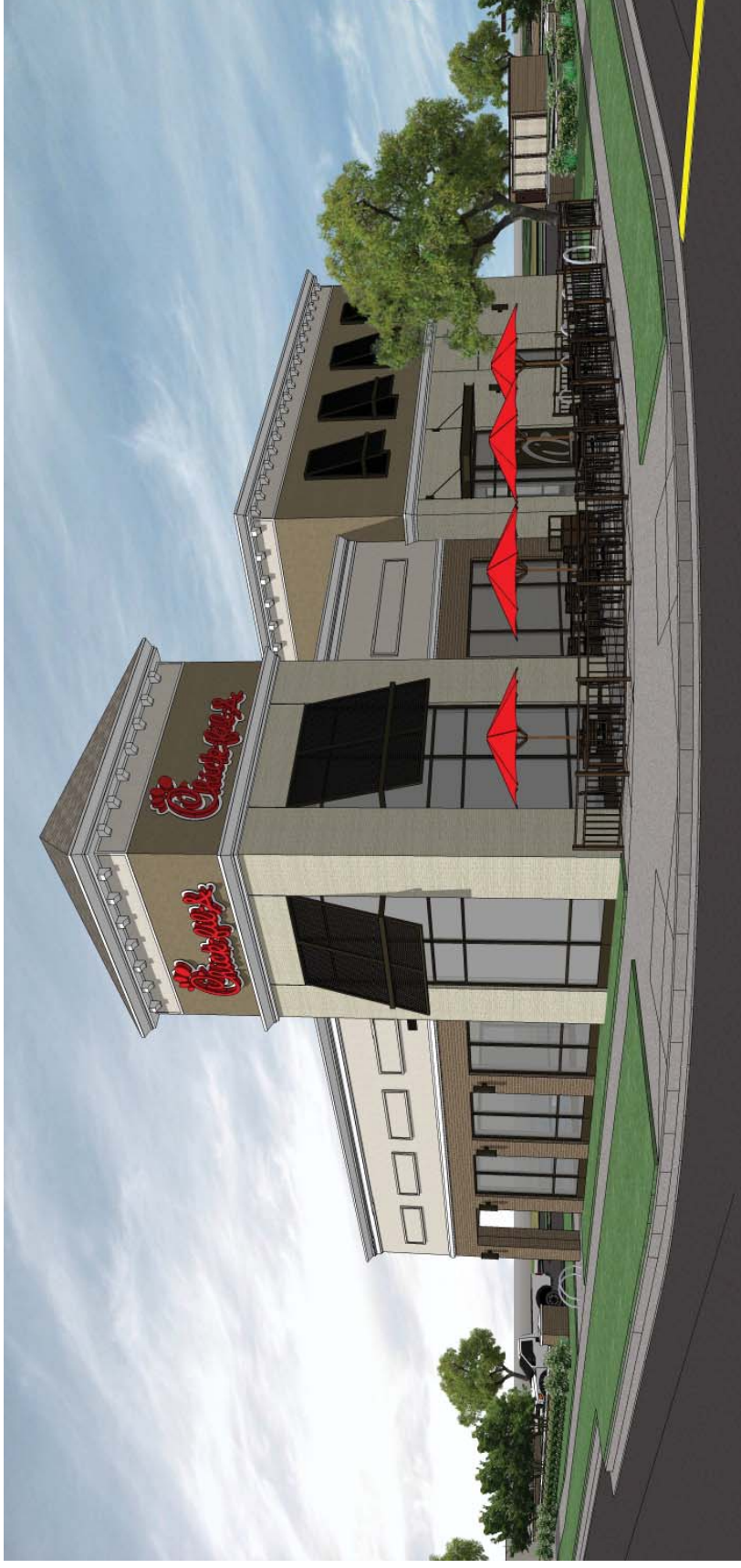
Perspective View - Play Area