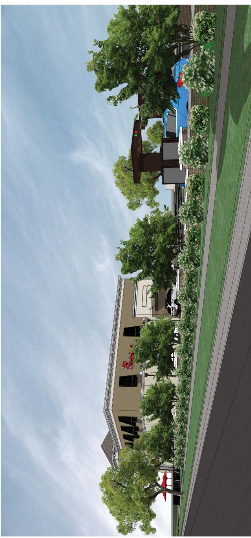
Perspective View - Street Level View