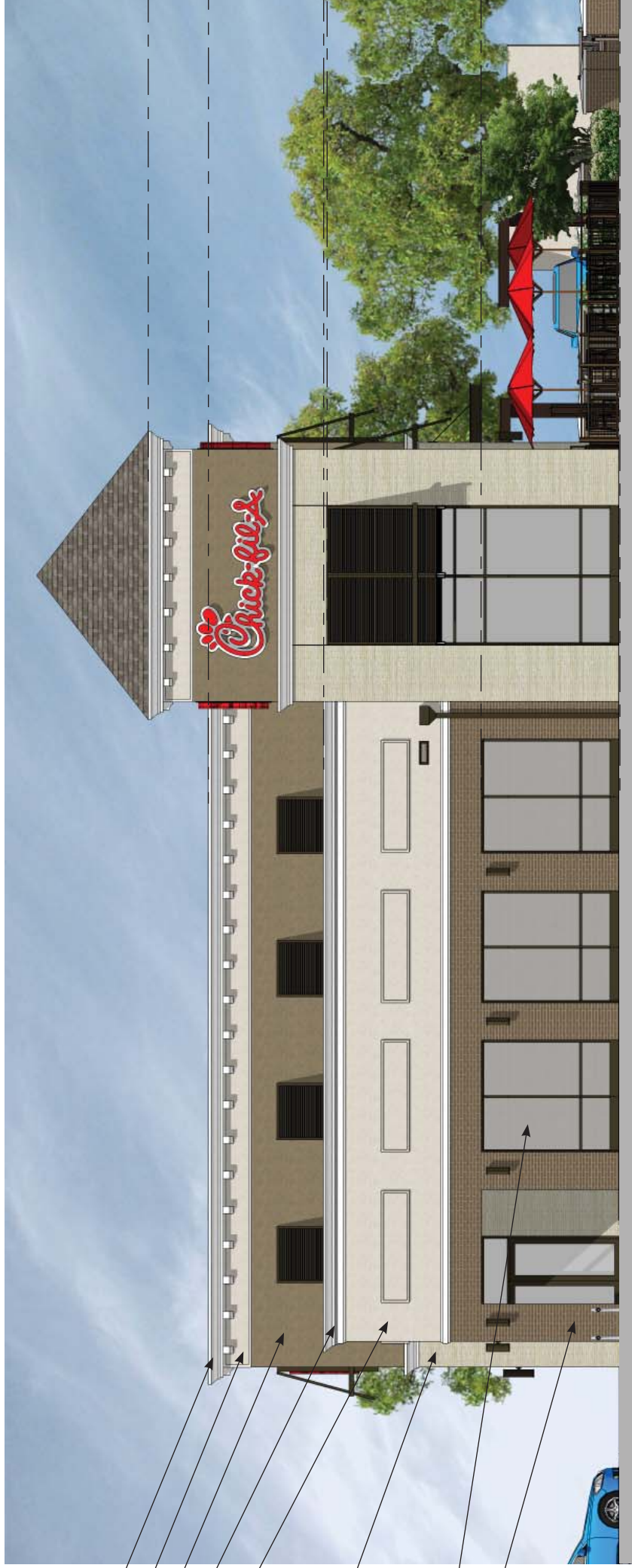
Elevation - Drive-Thru

T/PARAPET 29'-5 1/2" T/PARAPET 21'-3" T/BAND 15'-6" T/WINDOW 10'-0" FINISH SLAB 0'-0"