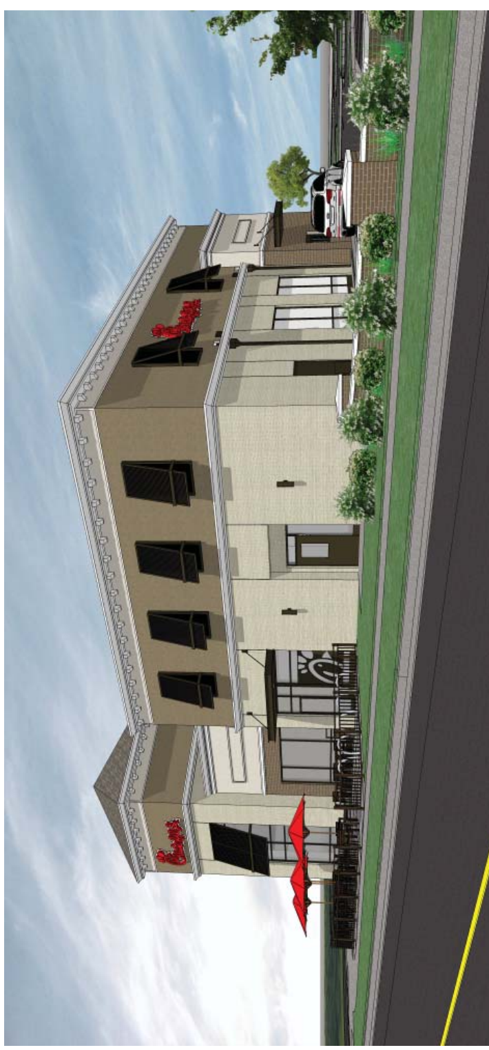
Perspective View - Service Entrance